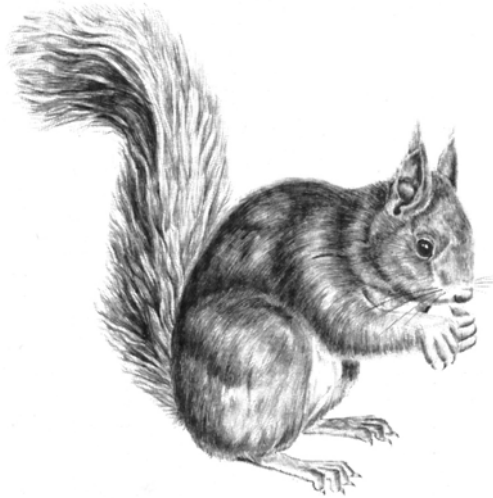
RED SQUIRREL Sciurus vulgaris